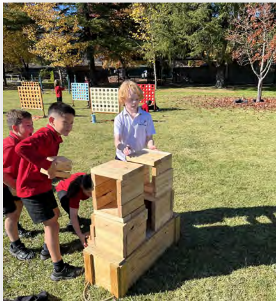
During Mental Health Week, Prep-6 students enjoyed playing yard games with students from St Mary's.