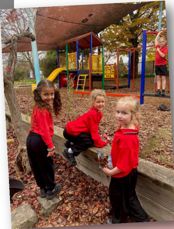
Crafty was surprised to find three beautiful peacocks playing peacefully around the Junior School while on yard duty. Their tail feathers looked magnificent!